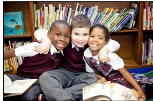
Committed to Excellence In Education

Phone: 212-876-7555 ext. 1 Fax: 212-876-0152 E-mail: ekillian@mchrschool.org www.mtcarmelholyschool.org