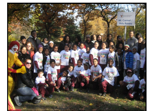
MCHR Runners pose with Ronald McDonald in Central Park

hospital stays, regardless of location or cost. To prepare for race day, students trained weekly in Jefferson Park in East Harlem and waved to our favorite neighbor, Rao's Restaurant on the walk to practice!